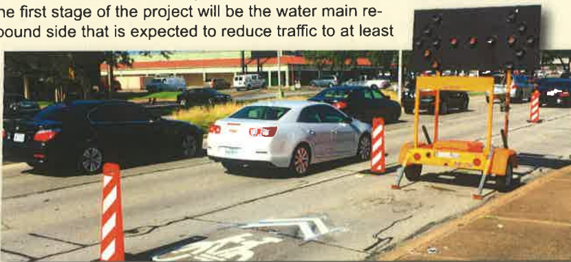
Traffic rolls slowly through the construction area on Valley View between Josey and Webb Chapel during peak hours.

Cost of the project is $3.1 million, funded by the 2015 bond issue. Completion is expected in May of 2017. Mr. Walhood said adjacent, affected property owners will be updated as the various stages of the project advance.